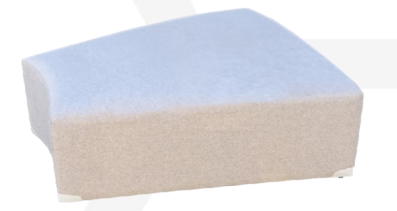
BOEJNR - BOEING JOINER