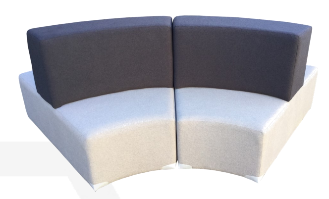
BOE02 - BOEING WITH BACK (Shown with 2 x single units)